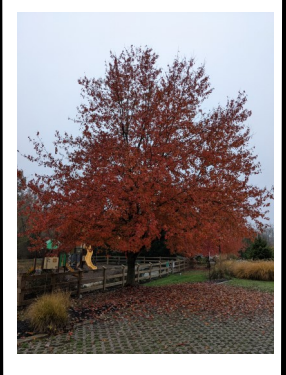
www.ChaddsFordPA.gov Find us on Facebook (Chadds Ford Township) and Instagram

Township Office Hours: 8am-4pm Mon.-Thurs. 8am-12pm Friday Chadds Ford, PA 19317 610-388-8800 (office) 610-388-5057 (fax)